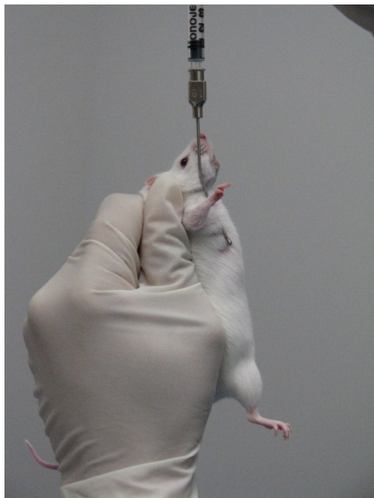
Image 1: Measure the length of the gavage tube from the tip of the nose to the last rib

7. Return the animal to the cage and monitor for 5-10 minutes, looking for signs of labored breathing or distress. Monitor animals again between 12-24 hours after dosing.