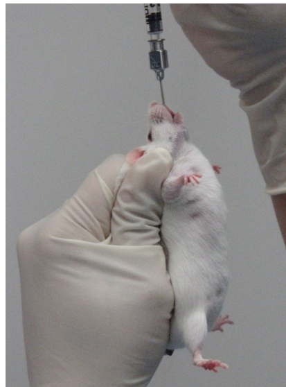
Image 2: Administer the solution upon verification of proper placement

Potential adverse effects to be considered: Perforation of the esophagus or stomach or respiratory distress